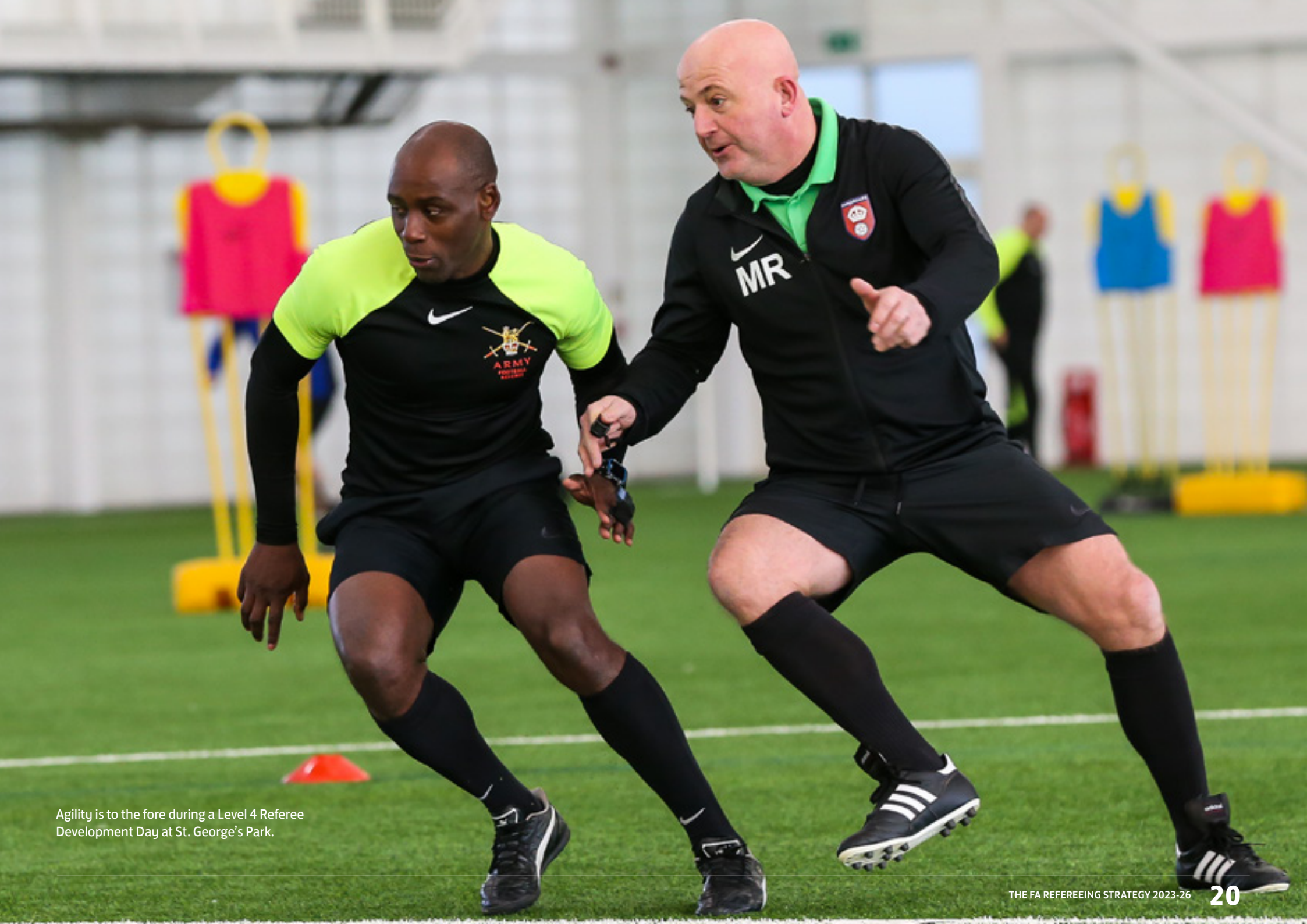
Agility is to the fore during a Level 4 Referee Development Day at St. George's Park.